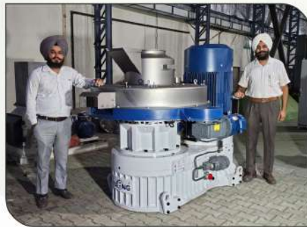
YULONG MAKE PELLET MILL (IMPORTED)