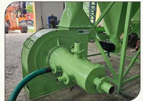
SUCTION POINTS OF DUST COLLECTOR