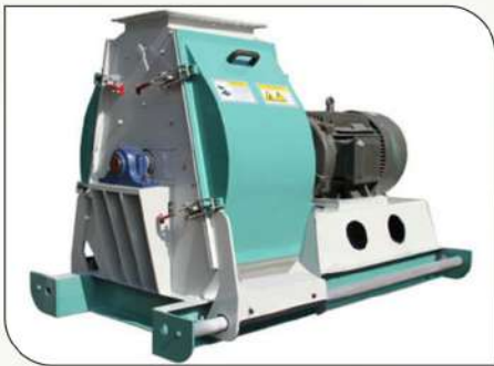
HAMMER MILL (FULL CIRCLE)